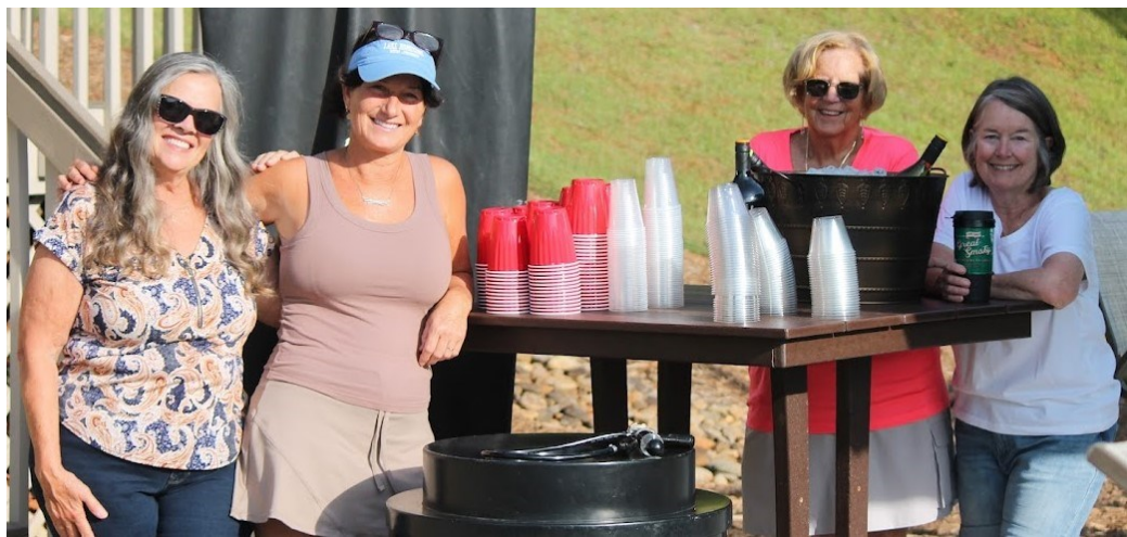
Club Championships and Membership Party, June 6, 2026