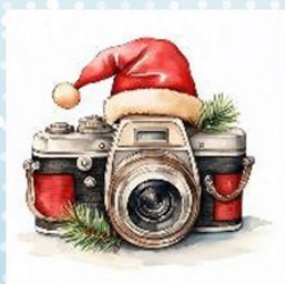
Get a Free Holiday Photo