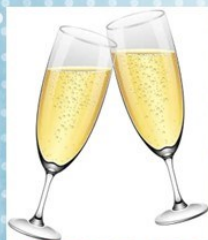
Complimentary glass at the door

Also included—salad, rolls, Lemon Chiffon Cake, tea, coffee